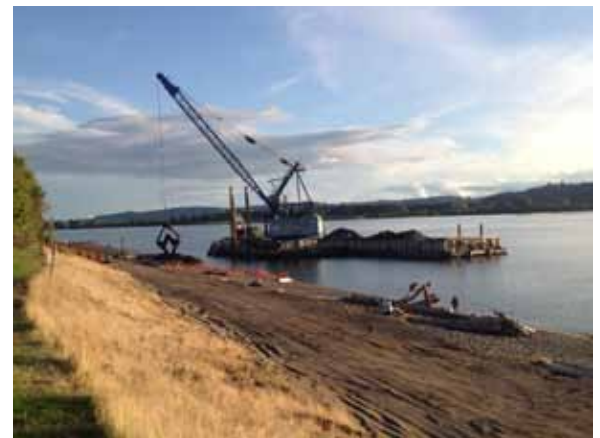
Dredge places sand on beach

HME Construction from Vancouver won the project in a public bid process. Pending permitting, the next stage will be nourishing the beach further north towards the administrative offices. The last beach nourishment project took place in the mid-1980s.